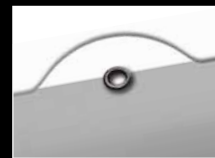
Calendar with hanger ...